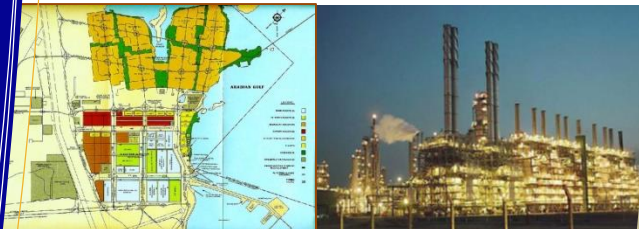
Jubail Industrial City

ALASAMER is belt to add-value and reduce customers' total cost by providing products and services using best business practices, understanding customers' needs, market Knowledge and establishment of a partnership concept both with customers and partners. By mid of 2016 we will have In-Kingdom stock of on-off valves, and automation products. Our facility is located in the third support industries- Jubail supported by over $ 120 MM stock in USA representing the world largest stockiest and valves automation supplier.