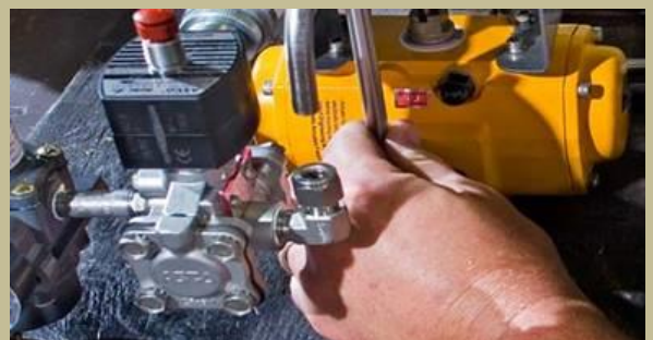
Valves Automation at Sunbelt Supply Company – Houston