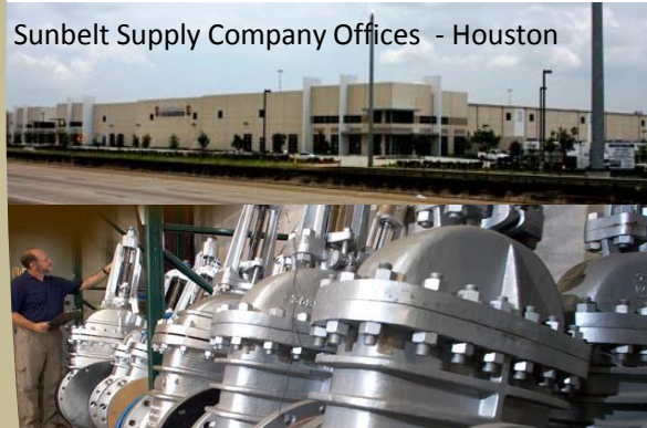
Sunbelt Supply Company Offices - Houston