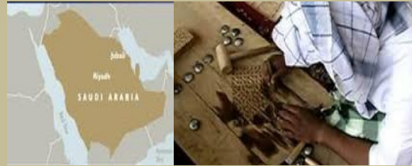
Jubail Location - Part of Saudi Heritage Shows

Continuously serve our customers with genuine quality items and support them with professional services designed to lower their total cost